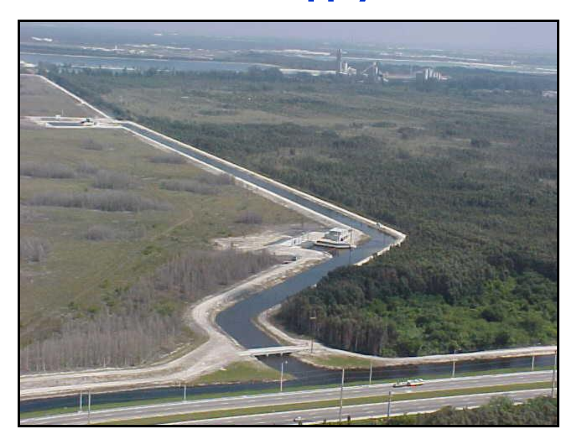
The supply canal links the Emergency Detention Basin and the C-4 Canal.