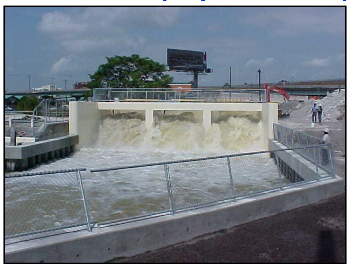
This pump is designed to counter the effects of the C-4 Pump