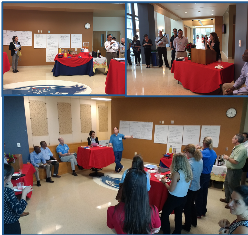
Concluding Remarks and Reception