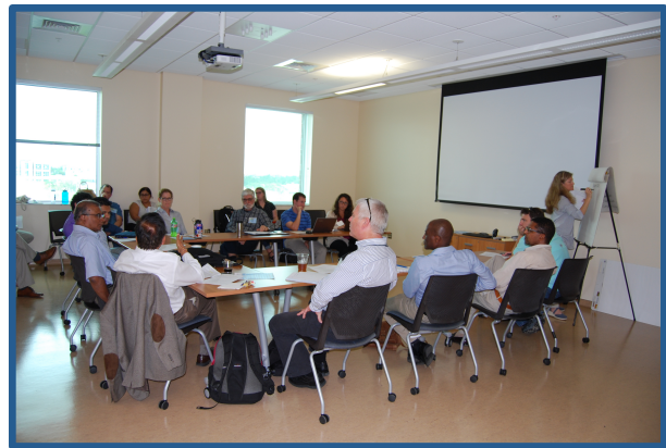
WERP Breakout Group