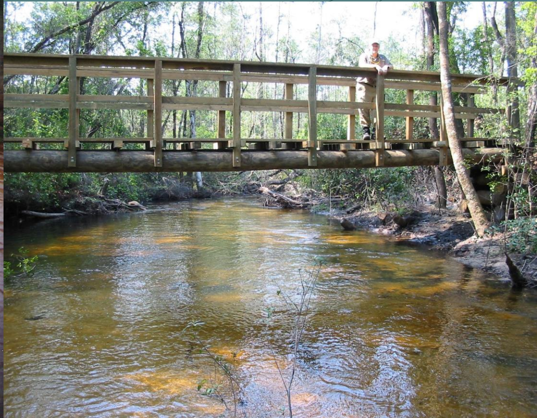
Big Fork Creek – Eglin Air Force Base