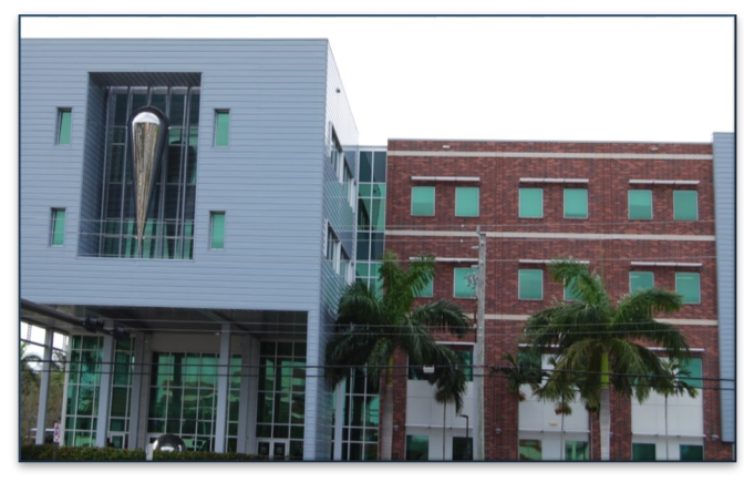
Located on the WEST side of College Ave

Davie West Building - 3rd Floor 3233 College Avenue Davie, Florida 33314 954.236.1334